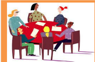
Purchase Committee should sign with date on the comparison sheet

Prepare a comparison sheet and select the most appropriate supplier