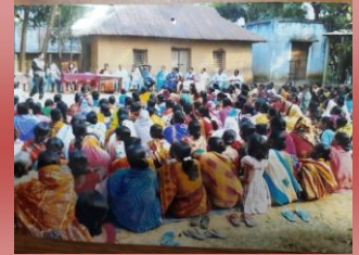
General Body Meeting

Formation of Purchase Committee in General Body Meeting (GBM)